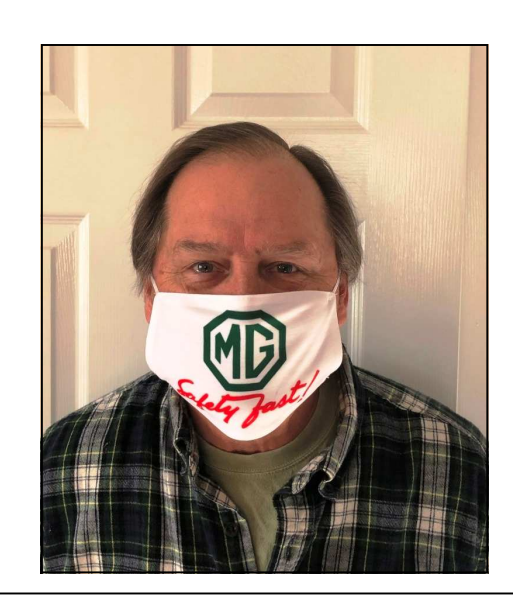
I don't know about all of you, but I'm still wearing a mask at indoor venues!